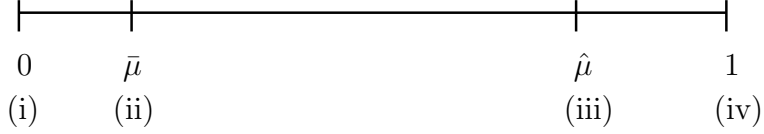
Figure 2: Visual representation of Proposition 2.2. The interval [0, 1] is shown, with \bar{\mu} and \hat{\mu} indicated as well. The Roman numerals indicate which part of Proposition 2.2 is relevant.